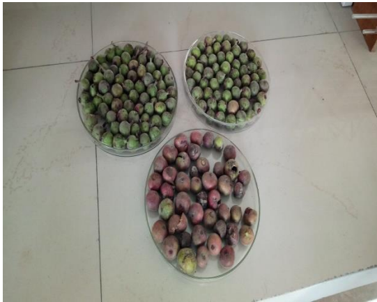
Fig. 1: Cluster fig fruit

Cluster fig, known for its rich medicinal properties, has been used for centuries to prevent and cure various ailments. This powerhouse of health benefits is particularly beneficial for women and adolescent girls. Its phytochemicals act as bioactive substances that aid in disease prevention and treatment. For women, cluster fig can help alleviate conditions such as mouth ulcers, oral infections, and menorrhagia, providing relief and promoting overall health. Adolescent girls can benefit from cluster fig's ability to treat skin conditions like pimples and freckles, as well as its potential to protect against urinary disorders and promote healthy growth during pregnancy. Its therapeutic uses extend to treating dysentery, burns, and even diabetes, making it a versatile and valuable addition to one's health regimen. The study was undertaken to incorporate the cluster fig in the diets of adolescent girls to utilise their health benefits.