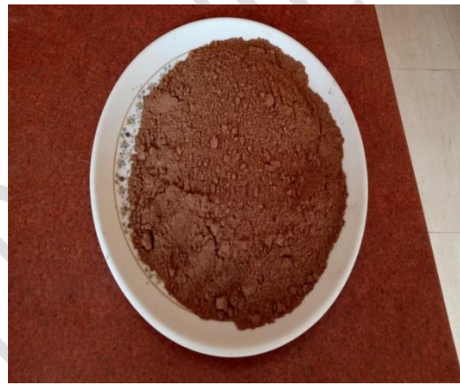
Fig. 2: Cluster fig Powder