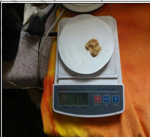
Fig 4: Sample kept on weighing machine