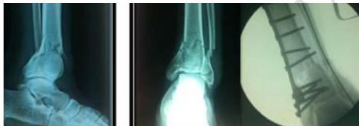
Figure 2: X-ray of the ankle face and profile showing (Ankle AP and lateral) a complex fracture of the tibial pilon treated with a trefoil plate with pinning of the fibula.