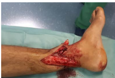
Figure 1: clinical image showing an open fracture of the left tibial pilon.

Clinically, we grouped 14 open fractures, or 22%; including 7 type I cases, 5 cases classified as type II, and 2 cases classified as type III.