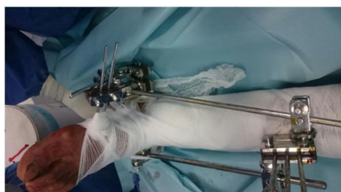
Figure 4: clinical image showing a Hoffman external fixator assembly.

In our study, the external fixator was used in 4 cases.