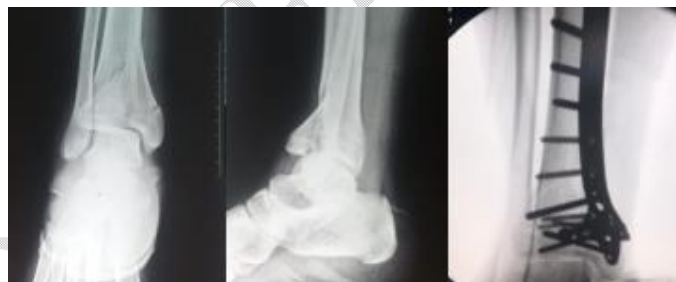
Figure 3: x-ray of the ankle front and profile showing a complex fracture of the tibial pilon treated with a trefoil plate.