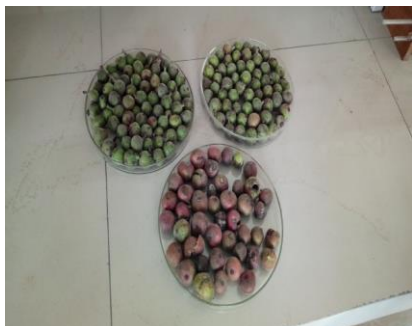
Fig. 1: Cluster fig fruit

Cluster fig's medicinal benefits extend to treating dysentery, muscle pain, and stomach-aches. It also lowers blood sugar levels, benefiting individuals with diabetes (Ghani, 2003). Its efficacy in treating skin diseases, chickenpox, and urinary disorders further underscores its therapeutic potential (Ghani, 2003). In sum, cluster fig's nutritional and medicinal properties make it a valuable addition to the diet, promoting overall health and well-being.