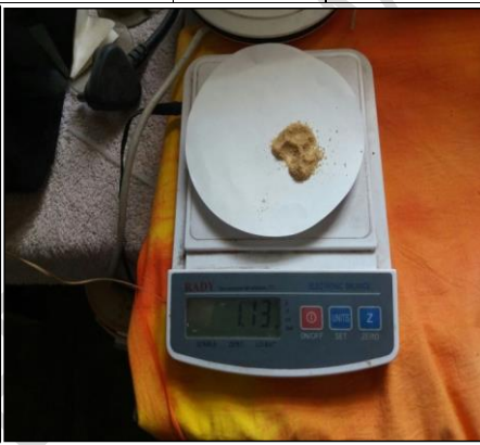
Fig 4: Sample kept on weighing machine