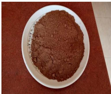
Fig. 2: Cluster fig Powder