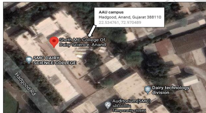
Figure 1: Land coordinates of solar PV site on google map

A 12 kWp ballast solar PV system (Make: Topsun Energy Limited, India) was installed based on space availability on terrace of workshop building of Dairy Engineering Department of SMC College of Dairy Science in Anand city of Gujarat state located at an altitude of 45.09 meter (mean sea level) having the latitudinal and longitudinal belt of 22°32'05.1" N and 72°58'13.7" E, respectively. The coordinates were obtained from google map. The land coordinate of the site is shown in figure 1