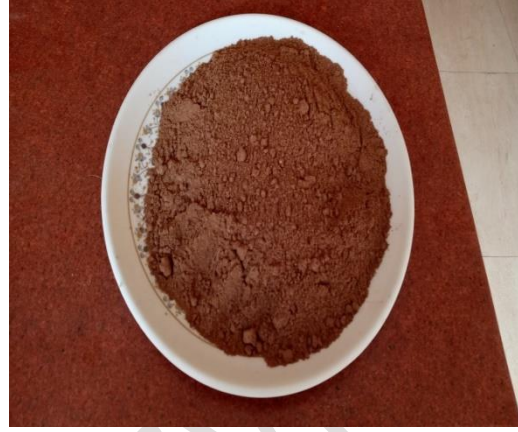
Fig. 2: Cluster fig Powder