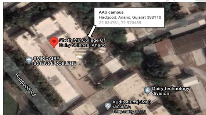
Figure 1: Land coordinates of solar PV site on google map

A 12 kWp ballast solar PV system (Make: Topsun Energy Limited, India) was installed based on space availability on terrace of workshop building of Dairy Engineering Department of SMC College of Dairy Science in Anand city of Gujarat state located at an altitude of 45.09 meter (mean sea level) having the latitudinal and longitudinal belt of 22°32'05.1" N and 72°58'13.7" E, respectively. The coordinates were obtained from google map. The land coordinate of the site is shown in figure 1